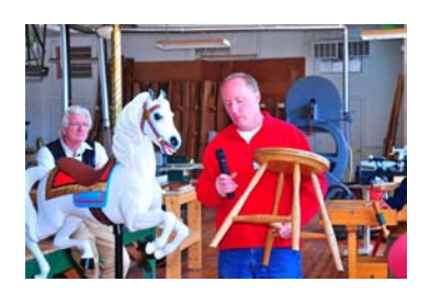
Wonderful four-legged stool by Pat Weisend .