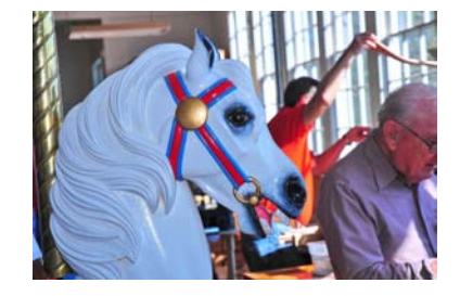
Close-up of horse created by Ira Chafin