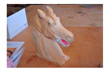
Head of Carousel horse at an intermediate stage of creation